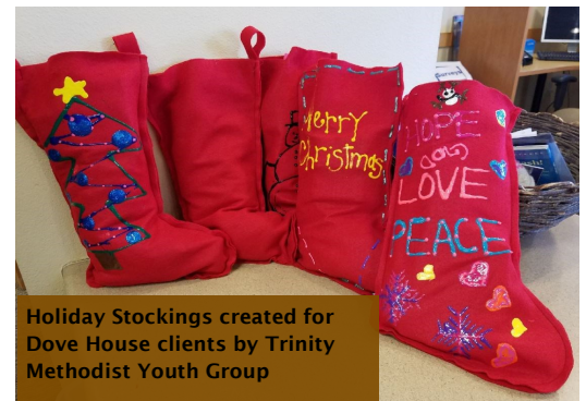
Holiday Stockings created for Dove House clients by Trinity Methodist Youth Group