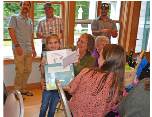
Lots of happy raffle winners!