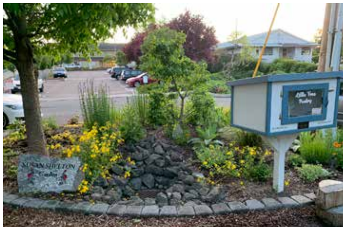
Dove House little free pantry and garden.

life circumstances and encounter barriers. Dove House advocates offer a listening ear and emotional support and connect mom with services and resources to help her reach her goals. The family continues to regain emotional health, perhaps with the help of a therapist provided with funding from Dove House and/or in conjunction with participation in one of our support groups.